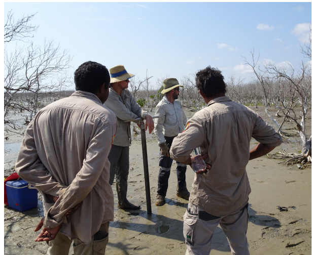
Working with Indigenous ranger groups in the Gulf has led to manuals for future monitoring, photo Norm Duke.