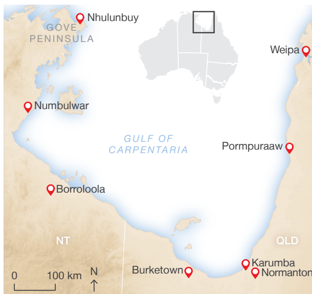
This project focuses on the Gulf of Carpentaria, particularly the major dieback areas from Pormpuraaw to Numbulwar.

relatively low percentage of trees have recovered and most are dying or dead, but there is no current formal assessment of the condition of affected forests and what proportion are recovering. Our understanding of the patterns of impact across the extent of dieback is also limited – in some areas, all mangrove species in all tidal elevations have been affected but in other areas, only some species in specific locations have been affected. The dieback was not discovered for nearly five months, and individual reports did not recognise the scale of the event, demonstrating shortcomings in coastal monitoring capability.