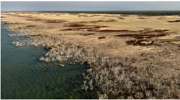
Four years after the dieback event, mangrove recovery in the Gulf seems limited, photo Norm Duke.

relatively low percentage of trees have recovered and most are dying or dead, but there is no current formal assessment of the condition of affected forests and what proportion are recovering. Our understanding of the patterns of impact across the extent of dieback is also limited – in some areas, all mangrove species in all tidal elevations have been affected but in other areas, only some species in specific locations have been affected. The dieback was not discovered for nearly five months, and individual reports did not recognise the scale of the event, demonstrating shortcomings in coastal monitoring capability.